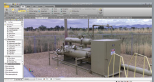
Capture large amounts of rich data in the field to perform measurements and prepare comprehensive deliverables in the office later.